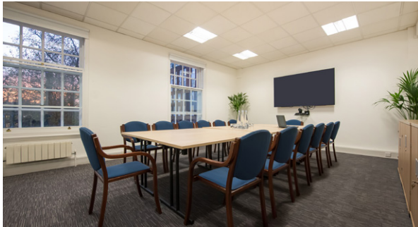
Tudor-Hart room Second Floor