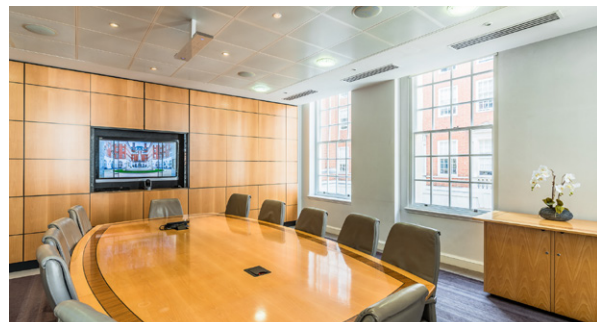
Carter room First Floor