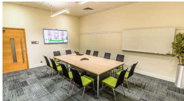
Lister/ Fleming rooms Third Floor