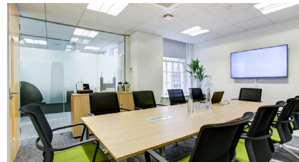
Magill room Second Floor