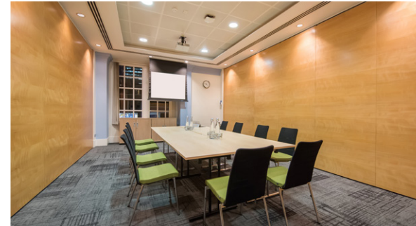
Barnes room Ground Floor