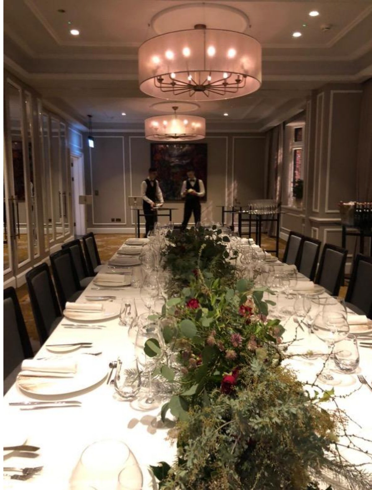
Table runner for a winter's wedding