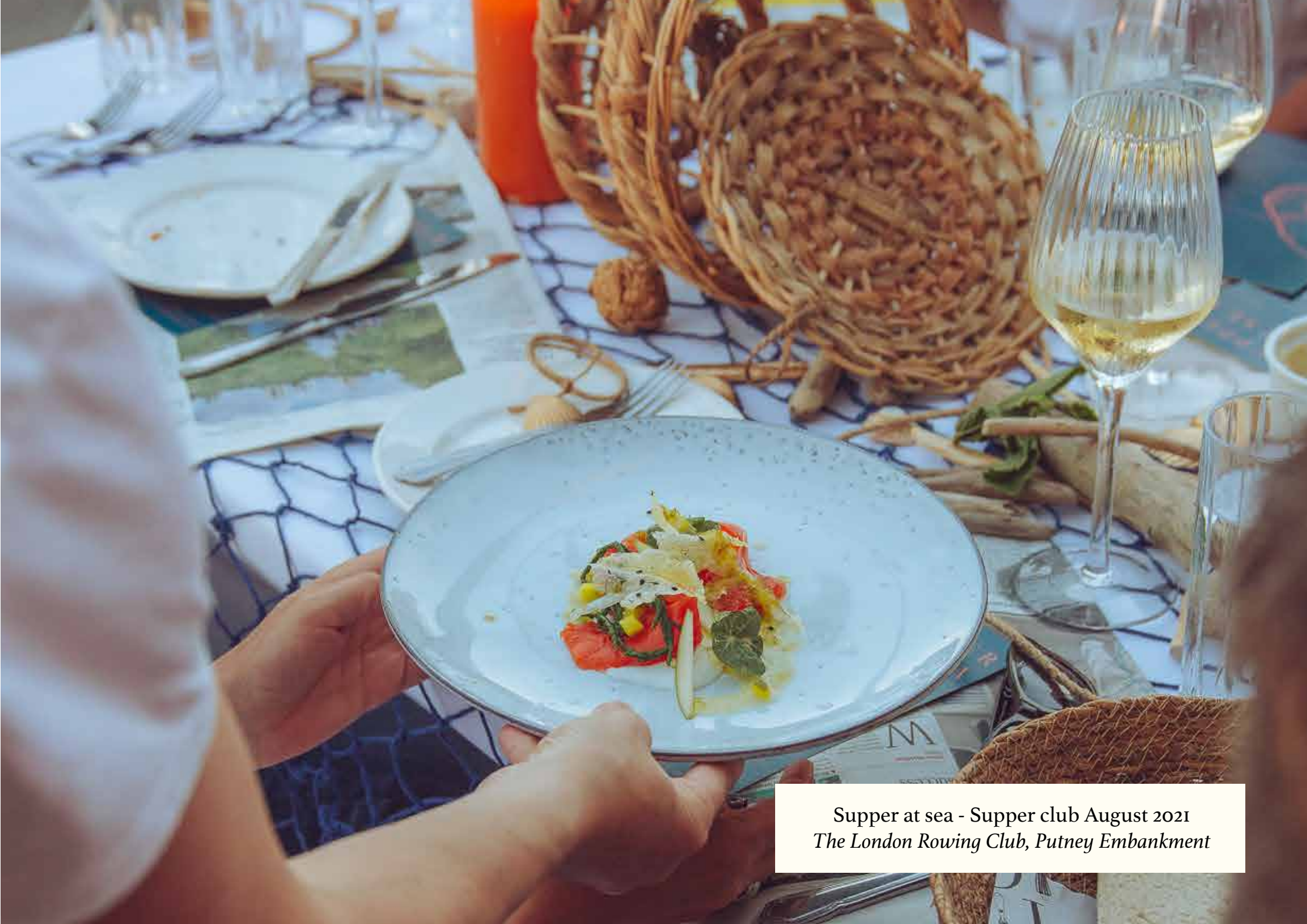
Supper at sea - Supper club August 2021 The London Rowing Club, Putney Embankment