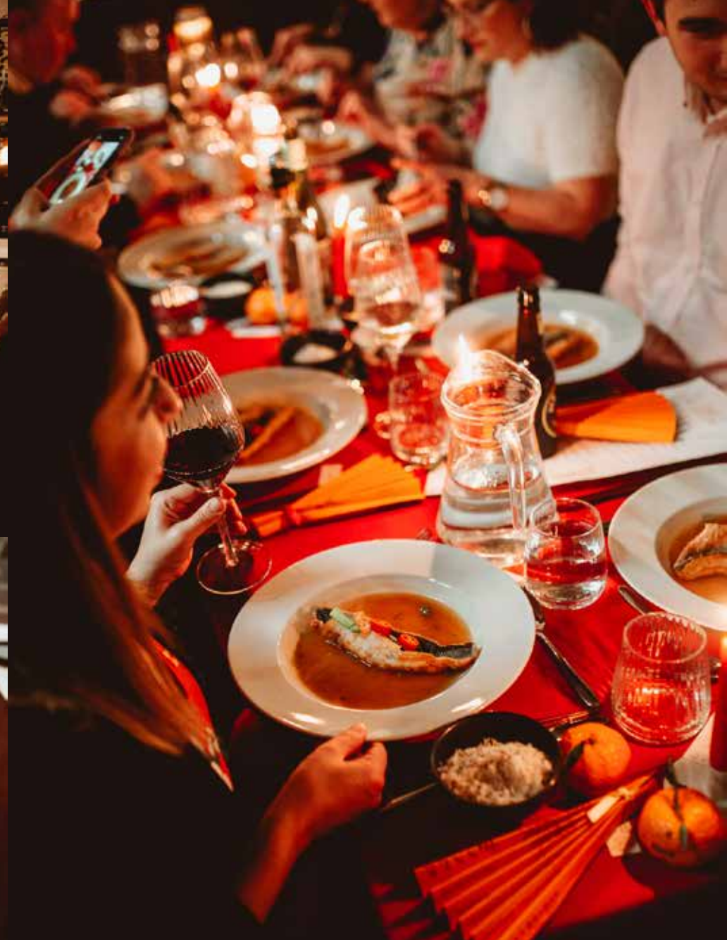
Chinese New Year - Supper club February 2022 Saint Espresso, Hackney Wick