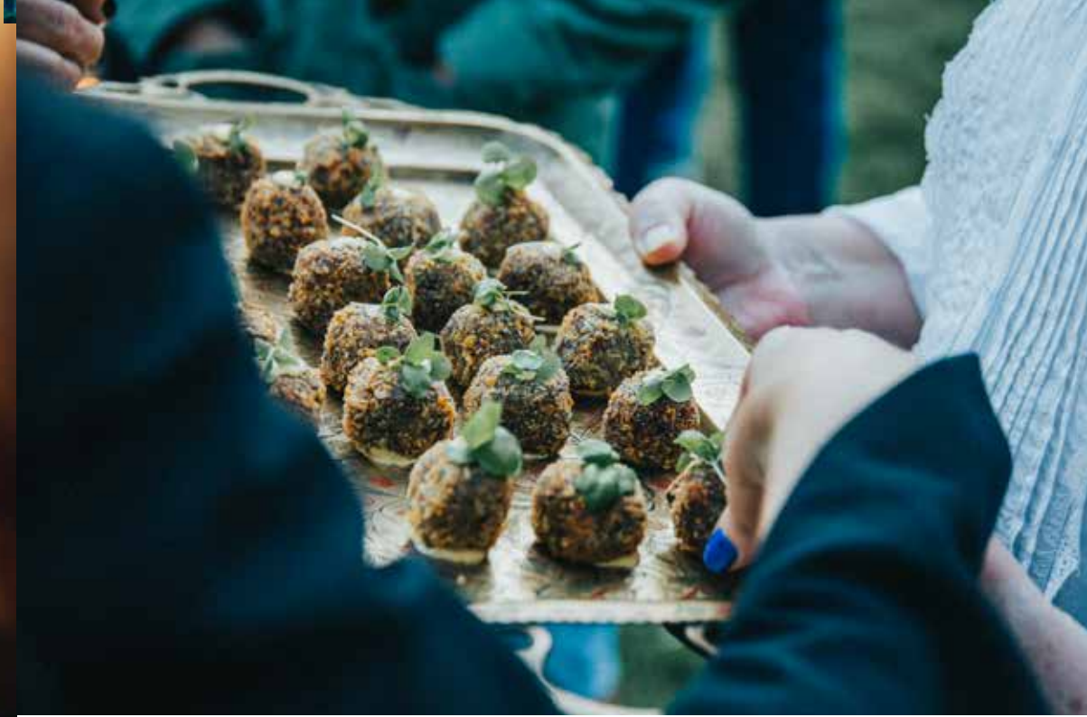
On the farm - Supper club September 2021 Newton Stacey Farm, Hampshire